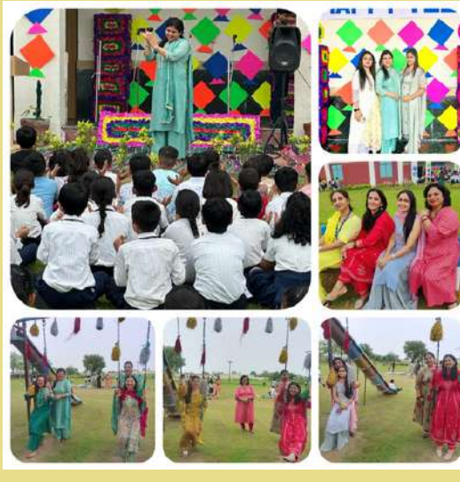
Celebrate Today, Cherish Tomorrow