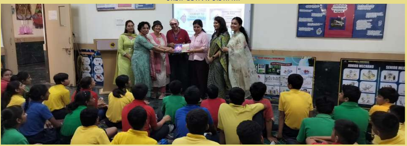
Embark on a Meditation Adventure with TSUS

School organised a meditation workshop for students of Form VI to IX. The theme of the workshop was "Confident and Winning Personality through Meditation". This workshop also included the meaning of meditation, importance of meditation and also taught the students how to meditate. All the students actively participated and did meditation on the spot for 5 minutes. The workshop proved very knowledgeable for improving personality of the students.