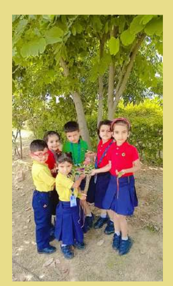
Shrians tying Rakhi to Trees