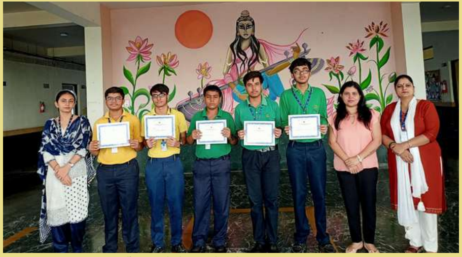
A Journey of Knowledge and Achievement