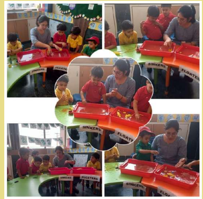
Unlocking Potential: Hands on Activity