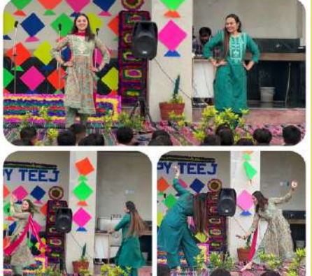
Every Day is a Reason to Celebrate!