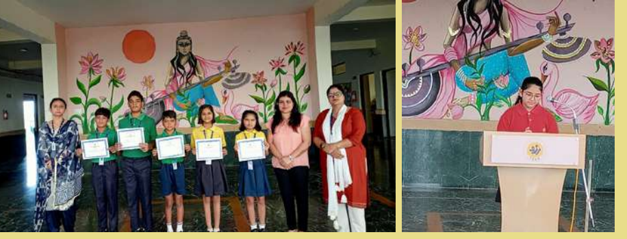
Aim High Achieve Higher