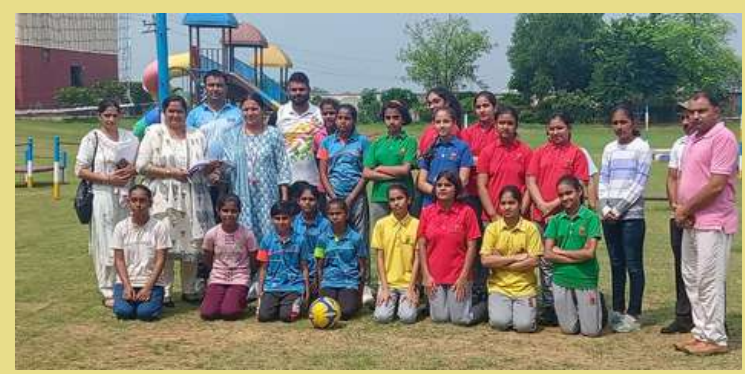
Strive the Greatness Through Teamwork