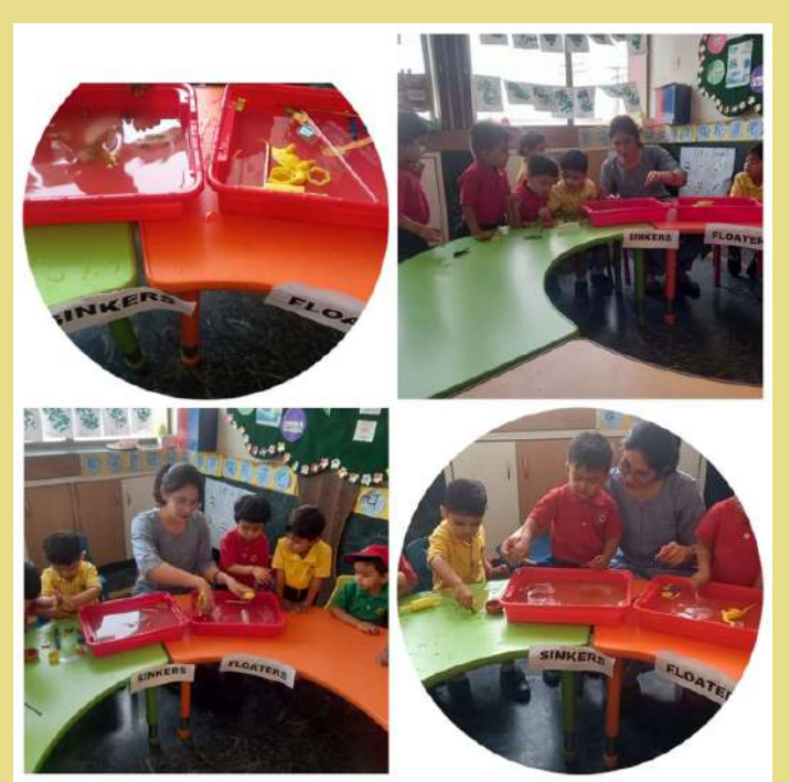
Marking Milestones and Making Memories

Science offers children an understanding of the world around them. It nurtures their curiosity and helps with the cognitive development of the children. In order to give the children the opportunity to learn and grow, sinking/floating, are seeds same, lava lamp experiments were conducted with them. They performed the experiments on their own with great zeal and zest.