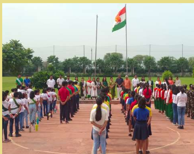
Celebrating Diversity, Creating change